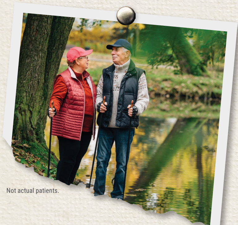
Not actual patients.

BAVENCIO first-line maintenance may help make a difference in your treatment journey for advanced bladder cancer