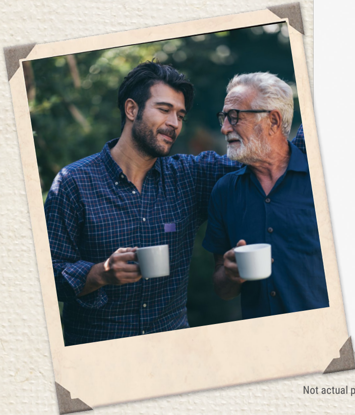
Not actual patients.

The safety of BAVENCIO was studied in one of the largest trials of patients with advanced bladder cancer—giving you and your doctor the right information to help support educated treatment decisions