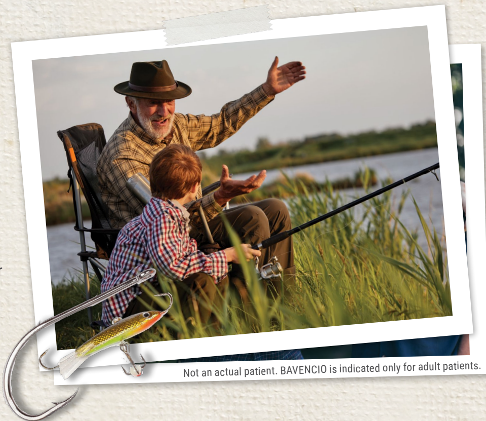
Not an actual patient. BAVENCIO is indicated only for adult patients.

Please see Select Safety Information throughout and full Prescribing Information and Medication Guide .