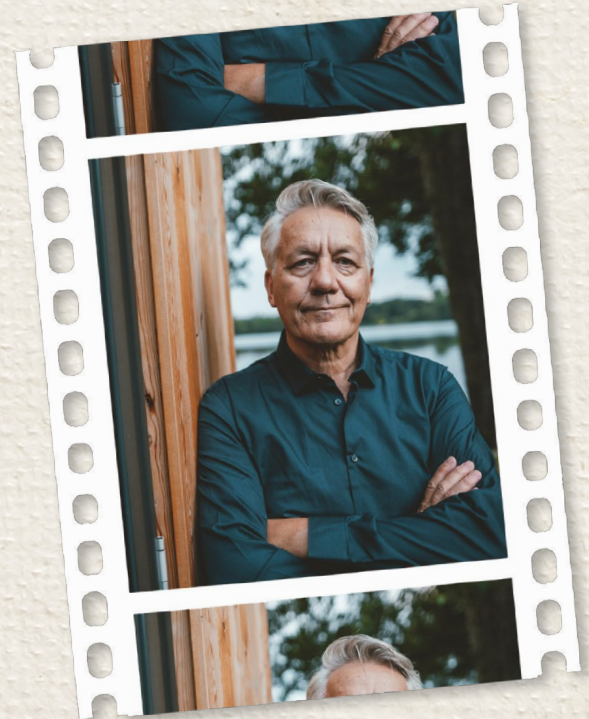
Not an actual patient.

Please see Select Safety Information throughout and full Prescribing Information and Medication Guide .